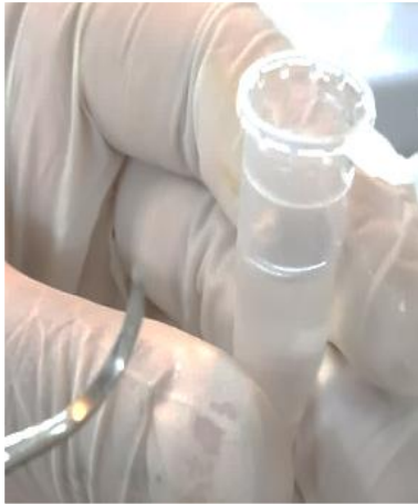
Fig. 2: Plaque sample collection with a curette in a Transport medium