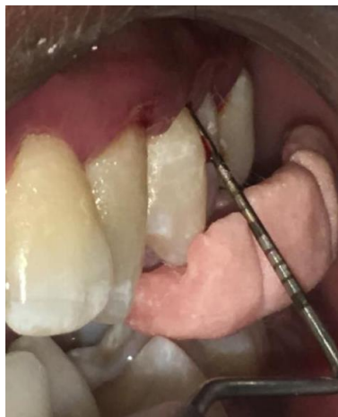
Fig. 8: Measurement of pocket depth after 21 days