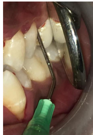
Fig.7: Ozonated oil application