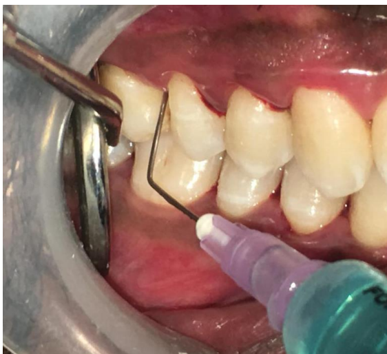
Fig 4: Chlorhexidine irrigation