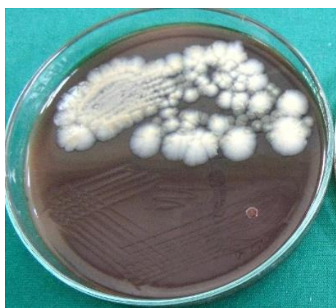
Fig. 9: Kanamycin Blood Agar showing P. gingivalis