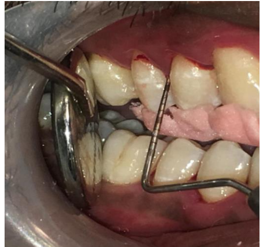
Fig. 5: Measurement of pocket depth after 21 days