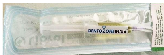
Fig. 1: Ozonated oil (Dentozone India)

Sample were kept in the Transport medium (RTF) [Fig 2] which were first vortexed then inoculated in the culture medium according to the requirement in Enriched and selective medium. For, Pg, Blood Agar as an enriched medium, Brucella agar with hemin and vit K and (BA) was used. Incubation was done at 37 °C for 3-4 days in anaerobic jar (strictly anaerobe). Kanamycin Blood Agar as anaerobic selective medium was used. Its same as blood agar only Kanamycin is added which makes it selective medium. Then after completion of incubation the plates were removed and the colony characters of the required organism and also the colony count was done for quantification. Then performed for Grams staining – seen for Gram Negative Coccobacilli. These organisms were confirmed by gram staining and key biochemicals- Glucose, sucrose, cellibiose and arabinose.