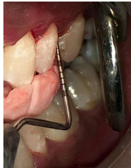
Fig. 6: Pre-operative pocket probing depth in ozonated oil group