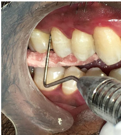
Fig. 3: Pre-operative pocket probing depth measurement in chlorhexidine group